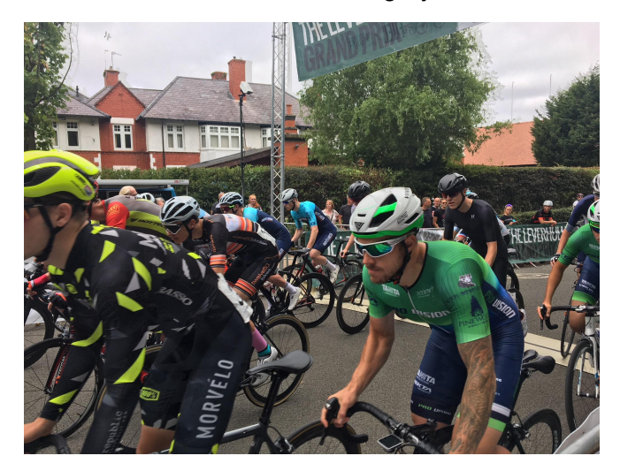
The LeverHulme Grand Prix Bike Race gets underway.

On 22<sup>nd</sup> July, Birkenhead Park, the first publicly funded park in Britain, became home of the annual closed circuit race, previously hosted by Birkenhead North End Cycle Club and The Bike Factory cycle store based in Chester. This year, the event was delivered with a new and improved race schedule, including junior, youth, adult female, male and para-cycling categories. The main event was named the Leverhulme Grand Prix and featured elite and category 1 racers.